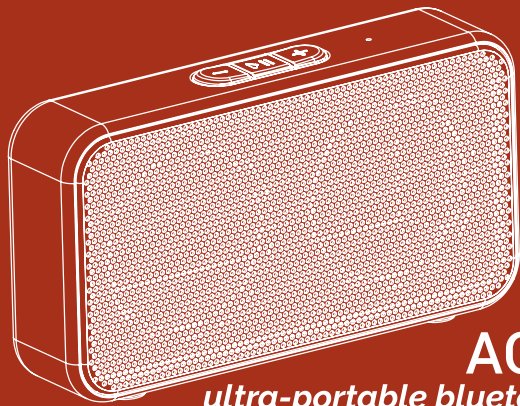
ACCENTO ultra-portable bluetooth speaker