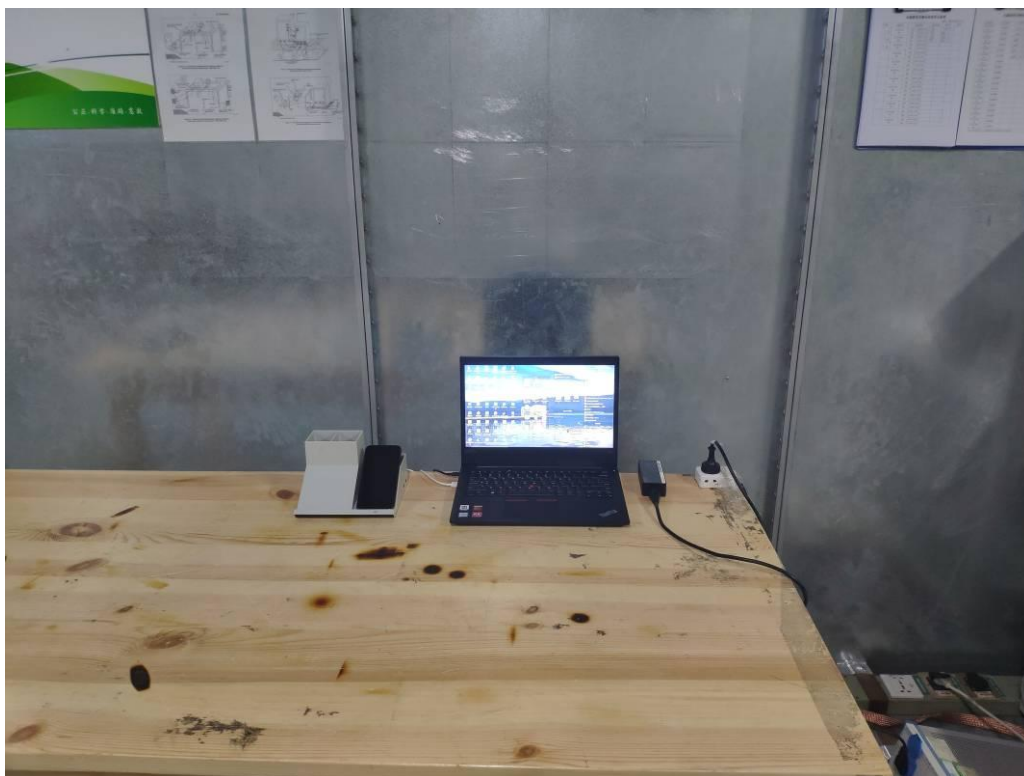
Conducted Emission-PC charge mode