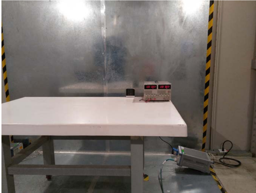
Conducted Emissions Side View