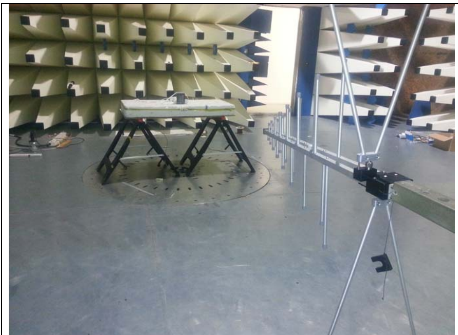
Fig 2 Test setup Rad Emissions