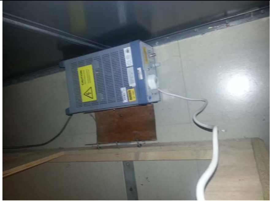
Fig 5 Conducted Emissions on the mains