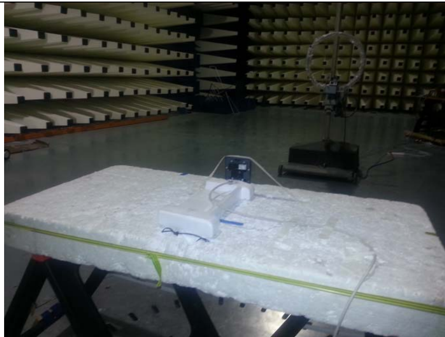
Fig 4 Test setup Rad Emission