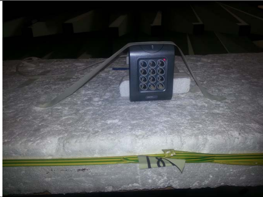
Fig 3 Test setup Rad Emission