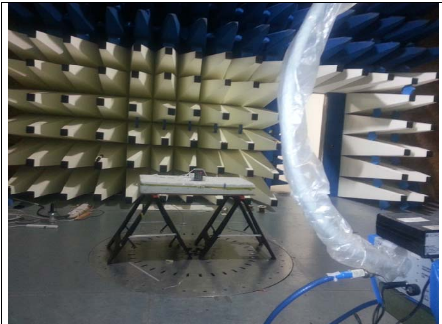
Fig 1 Test setup Rad Emissions