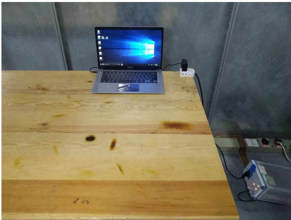
Charge from SW018S050300U1