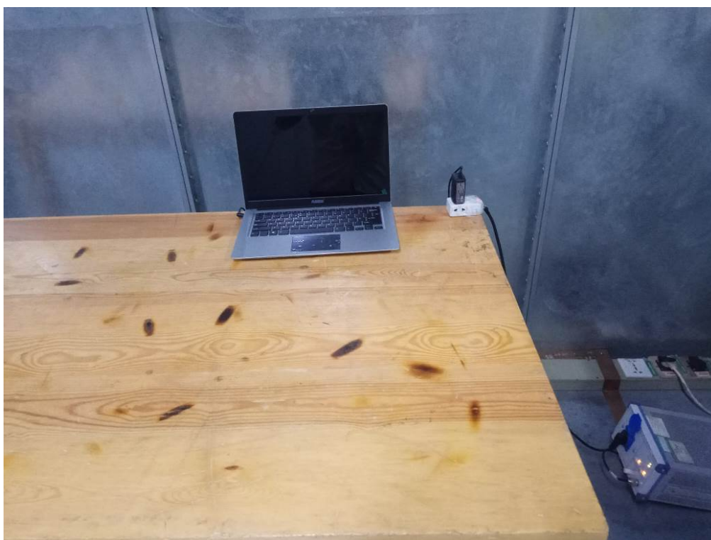
Charge from QH-053000BSA