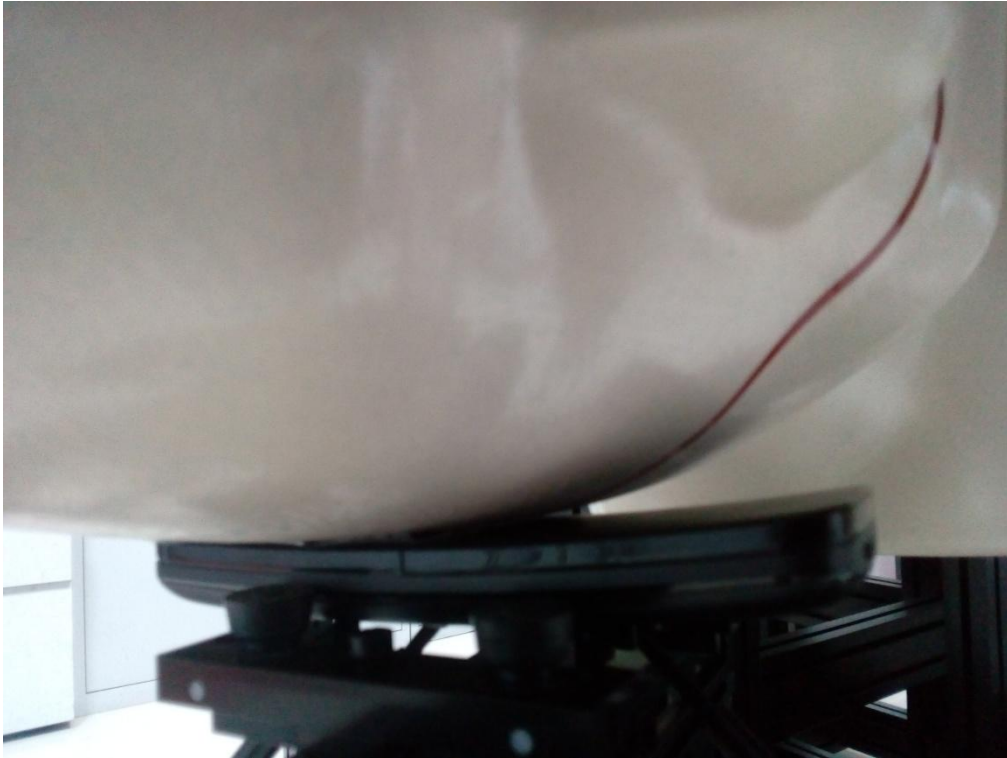
Head Right Tilt Setup Photo