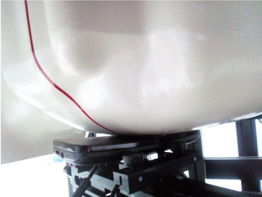
Head Left Tilt Setup Photo