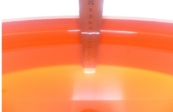
Tissue Simulant Liquid for Head 450