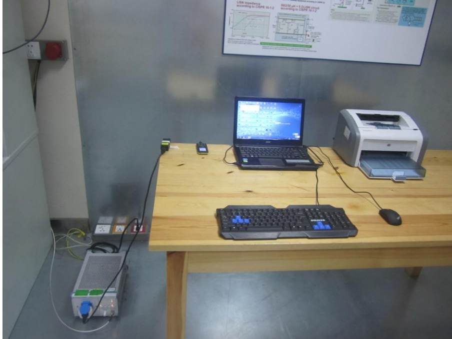
JBP radiation L