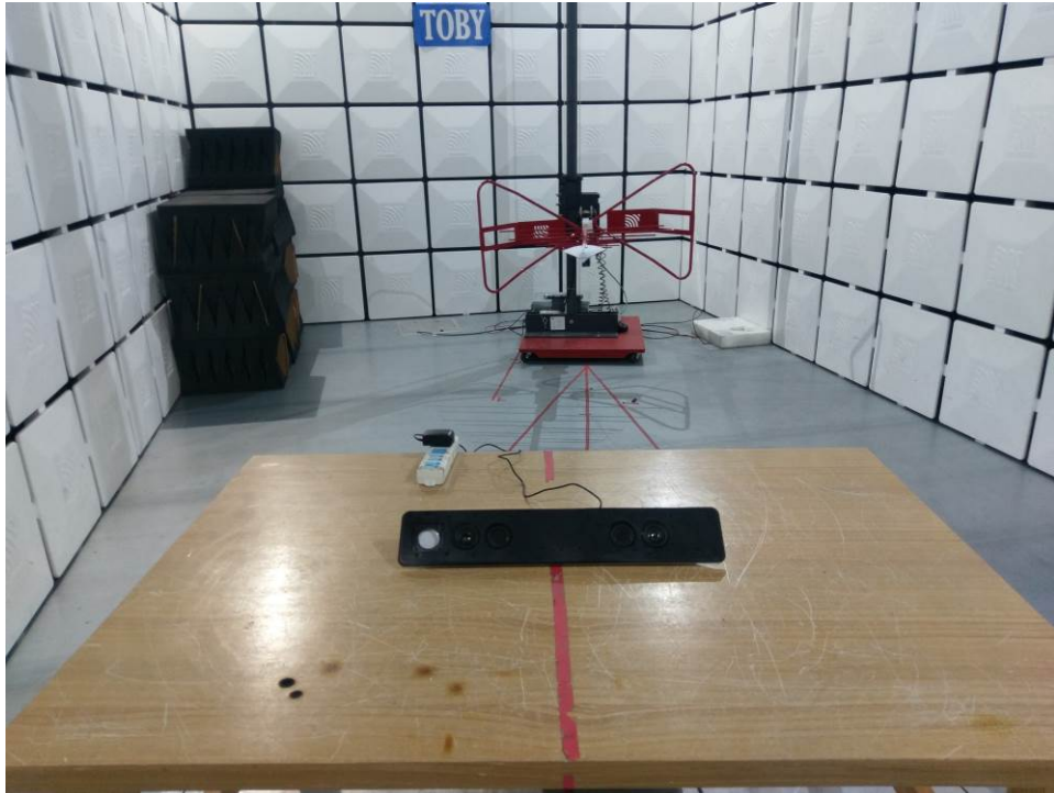
Radiated emission – above 1GHz