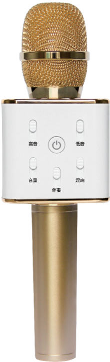
Tuxun Q7 Wireless Microphone & SpeakerUser Guide