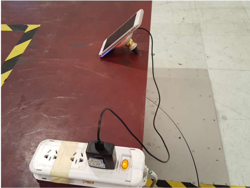
Conducted Measurement Photos