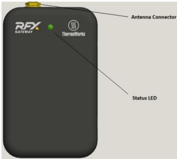
Device Layout (Rear)