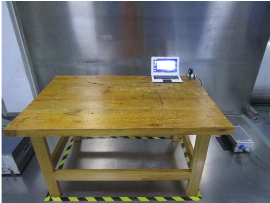
Conducted Emissions - Side View (Adapter #2)