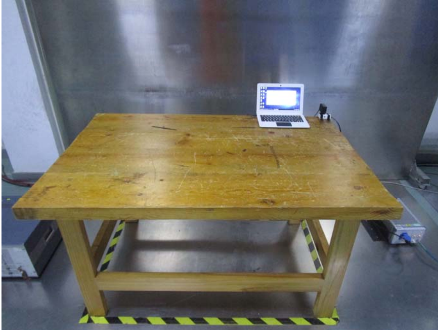
Conducted Emissions - Side View (Adapter #1)