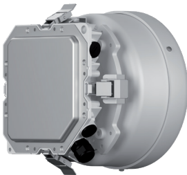
WiBAS ™ G5 evo-BS with 180° sectoral antenna