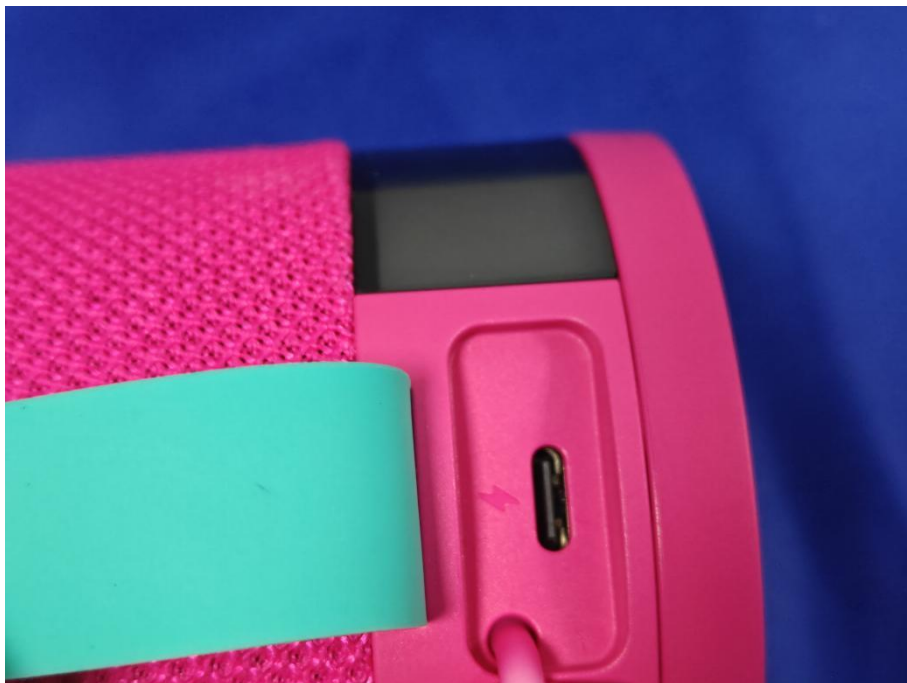
View of Product-8