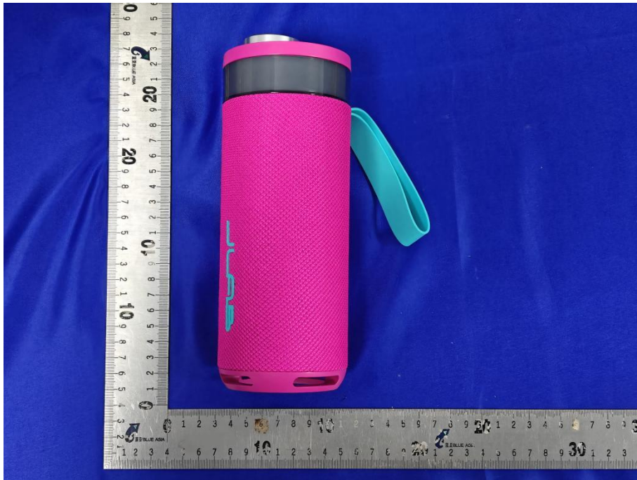
View of Product-3