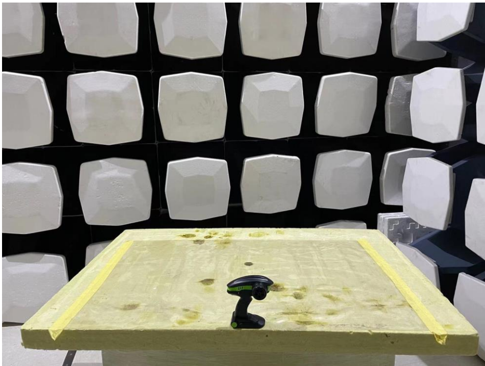
Up to 1GHz (EUT was placed in the centre of the turntable)