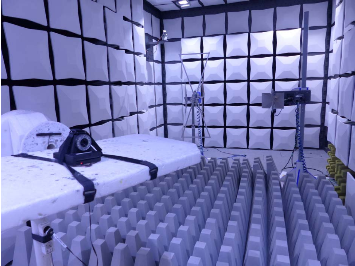
Photo 3: Test setup for radiated measurements (Enclosure, fully-anechoic chamber, 1-26 GHz intentional radiator §15, ANSI C63.10)