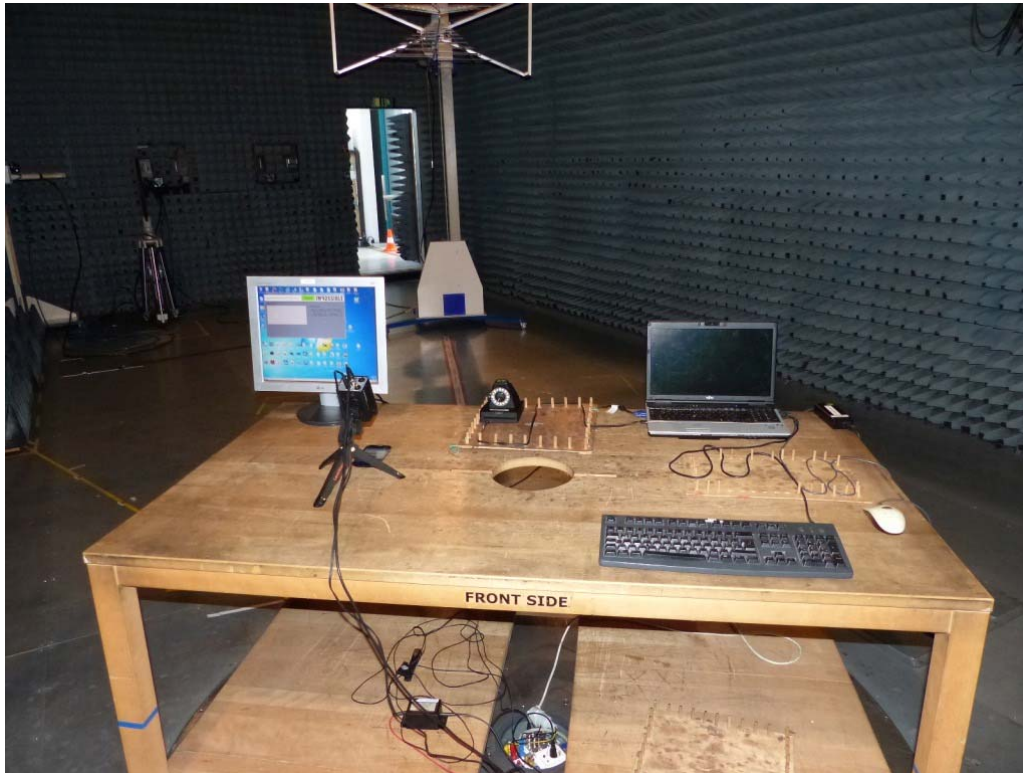
Photo 7: Test setup for radiated measurements (computer peripheral setup, EUT supplied by USB-cable from computer, unintentional radiator §15.109, ANSI C63.4)