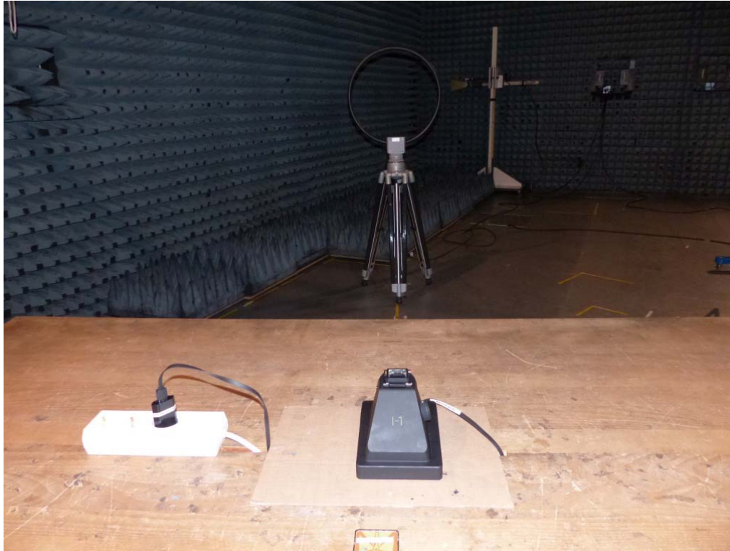
Photo 1: Test setup for radiated measurements (Enclosure, below 30 MHz, intentional radiator §15.209, ANSI C63.10)