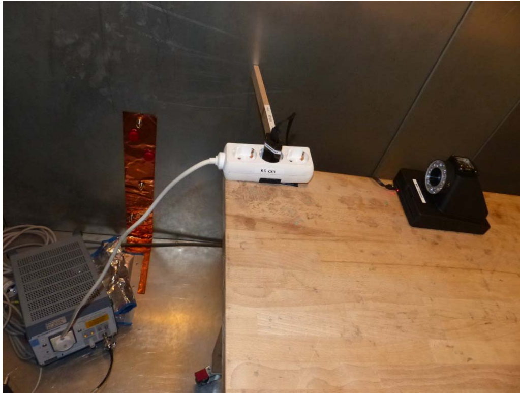
Photo 4: Test setup for conducted measurements (AC Port (power line), EUT supplied by AC/DC adapter, unintentional radiator §15, ANSI C63.10/4)