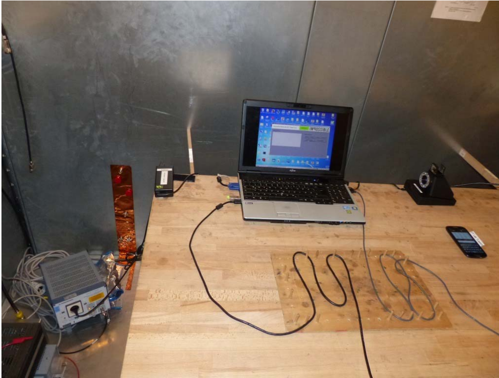
Photo 5: Test setup for conducted measurements (computer peripheral setup, EUT supplied by USB-cable from computer, unintentional radiator §15.107, ANSI C63.4)