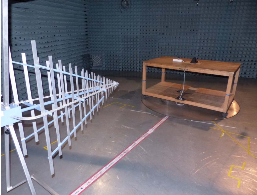
Photo 6: Test setup for radiated measurements (AC Port (power line), EUT supplied by AC/DC adapter, unintentional radiator §15.109, ANSI C63.4)