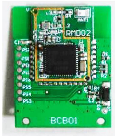
Figure are currently BCB01 base board to use.

User can be used with different base board to do use.