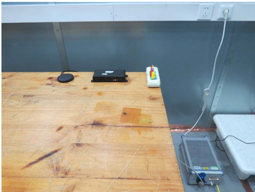
Picture2: Conducted Emissions Test Setup