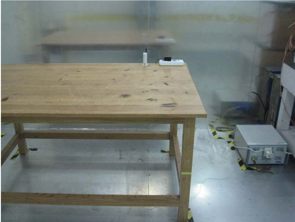
Radiated Measurement Photos (Below 1GHz)