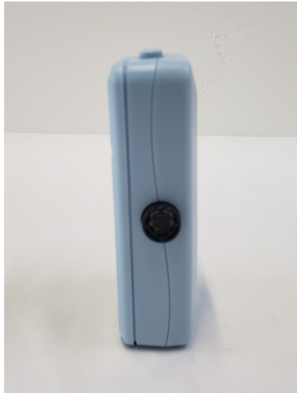
Figure 5. Right Side of EUT

FCC Part 15 Certification 2AHQD-SENSOR4 22-0125 June 6, 2022 Clean Hands Safe Hands, LLC Gen4 Sensor