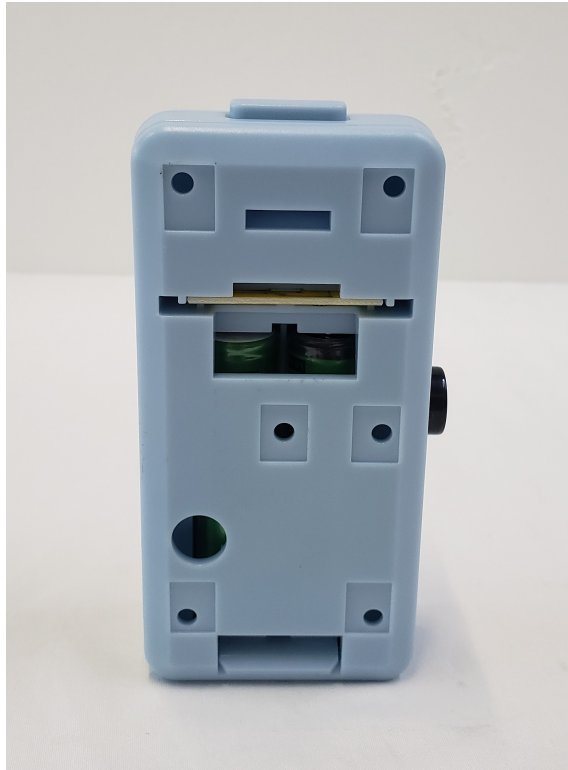
Figure 2. Back of EUT with wall plate

FCC Part 15 Certification 2AHQD-SENSOR4 22-0125 June 6, 2022 Clean Hands Safe Hands, LLC Gen4 Sensor