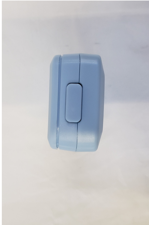
Figure 1. Top of EUT