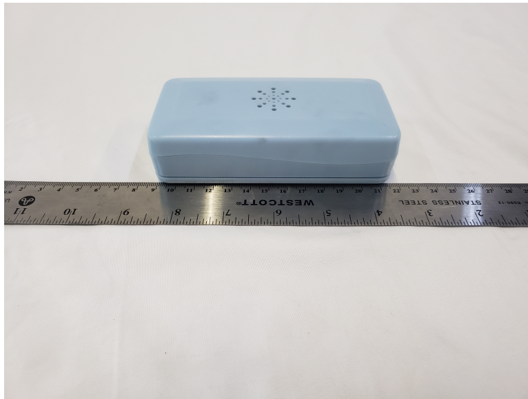
Figure 4. Left Side of EUT

FCC Part 15 Certification 2AHQD-SENSOR4 22-0125 June 6, 2022 Clean Hands Safe Hands, LLC Gen4 Sensor