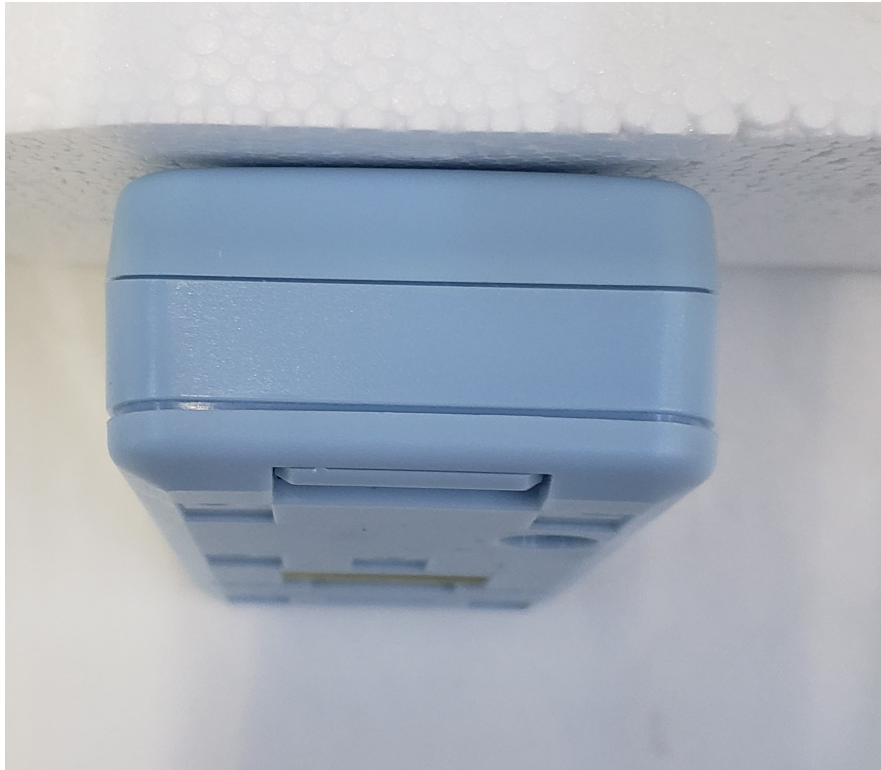
Figure 7. Bottom of EUT

FCC Part 15 Certification 2AHQD-SENSOR4 22-0125 June 6, 2022 Clean Hands Safe Hands, LLC Gen4 Sensor