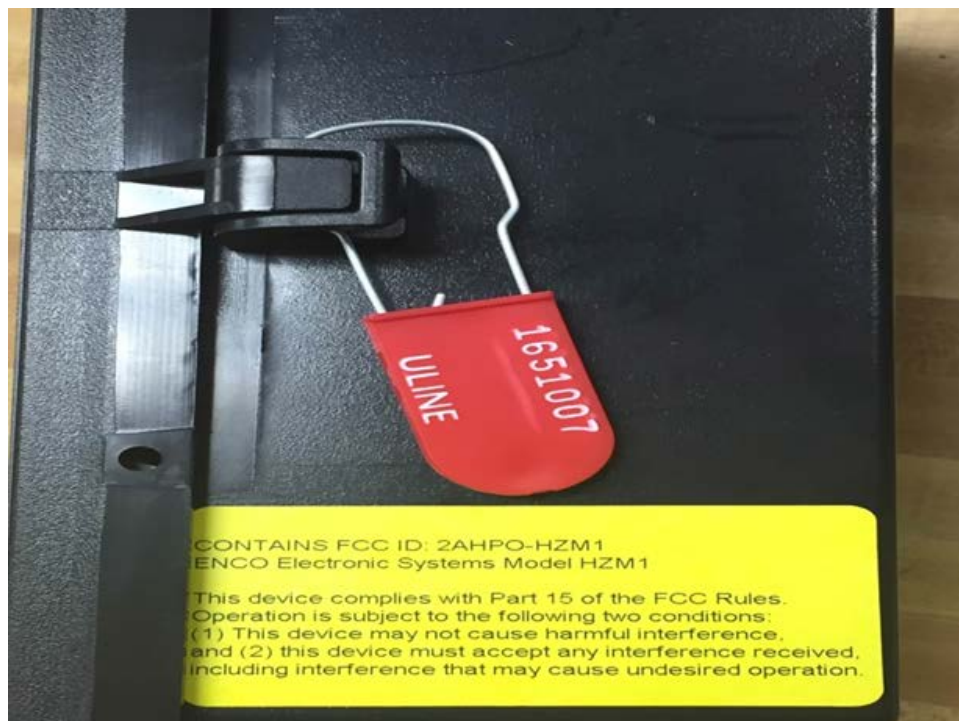
Figure 2: Host Sample Label and Location