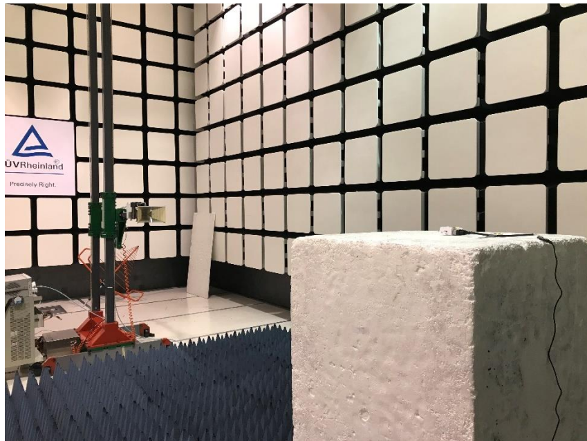
Figure 3: Radiated Spurious Emissions Above 1 GHz