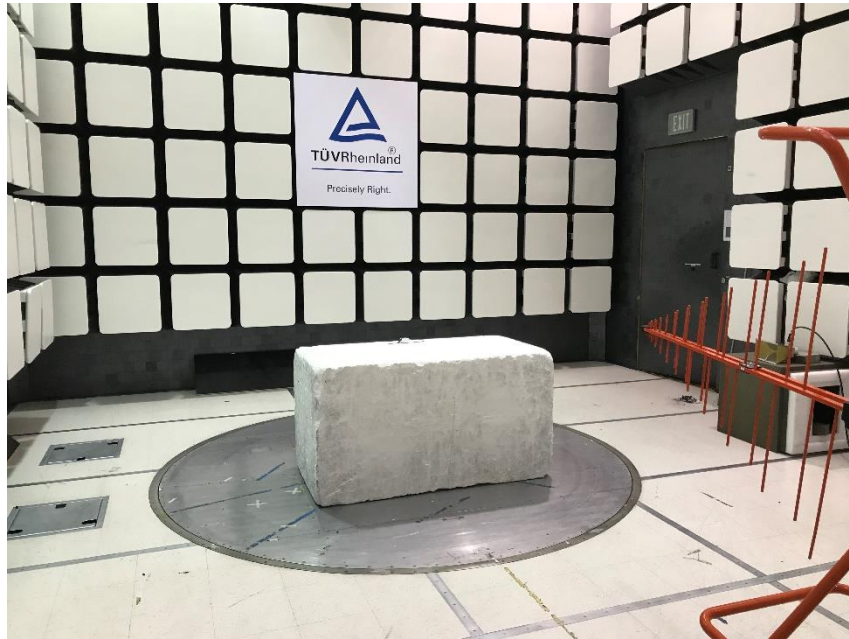
Figure 1: Radiated Spurious Emissions Below 1 GHz