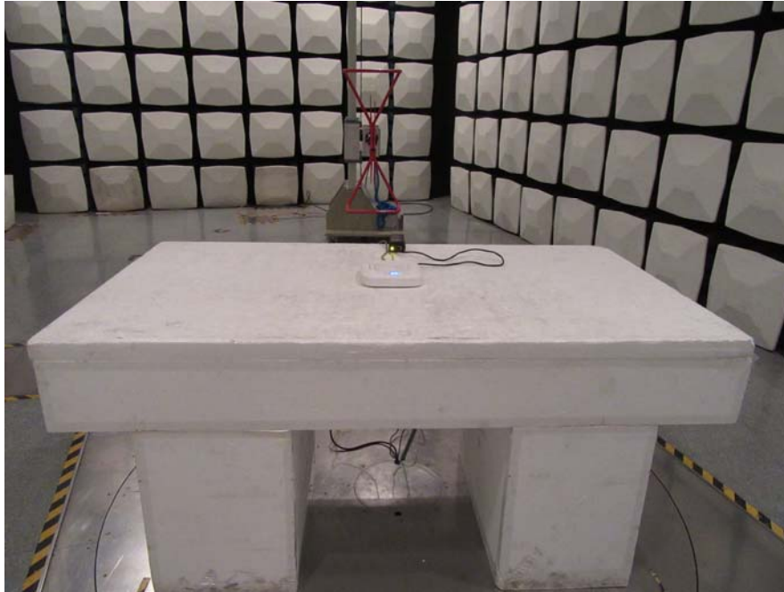
Radiated Emission View (Above 1 GHz)