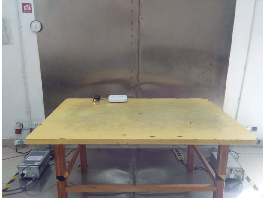
Conducted Emission Rear View