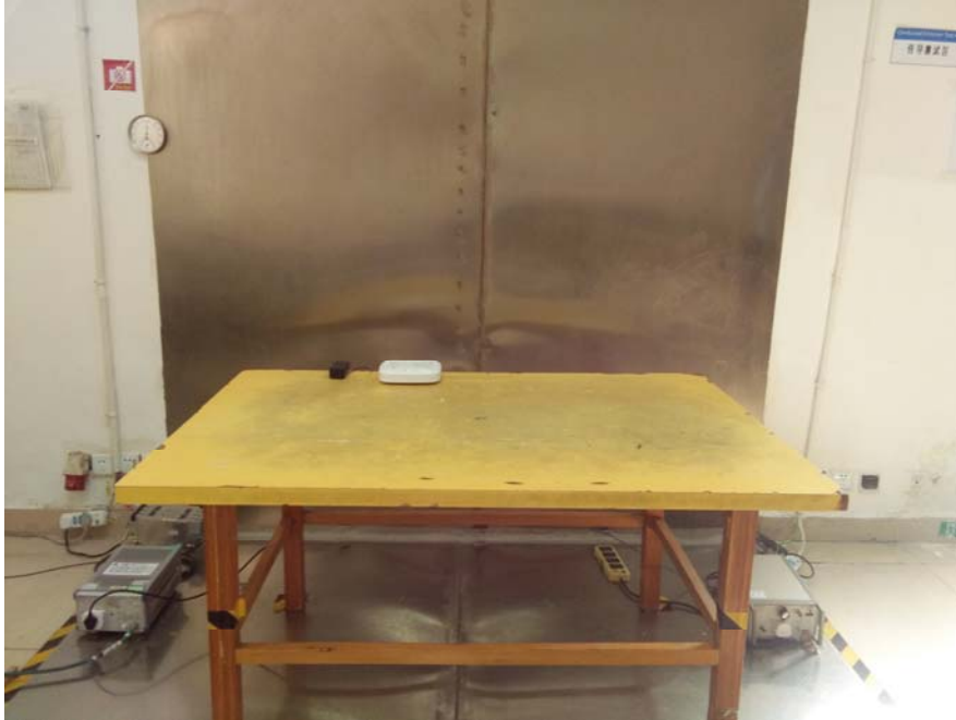
Conducted Emission Rear View