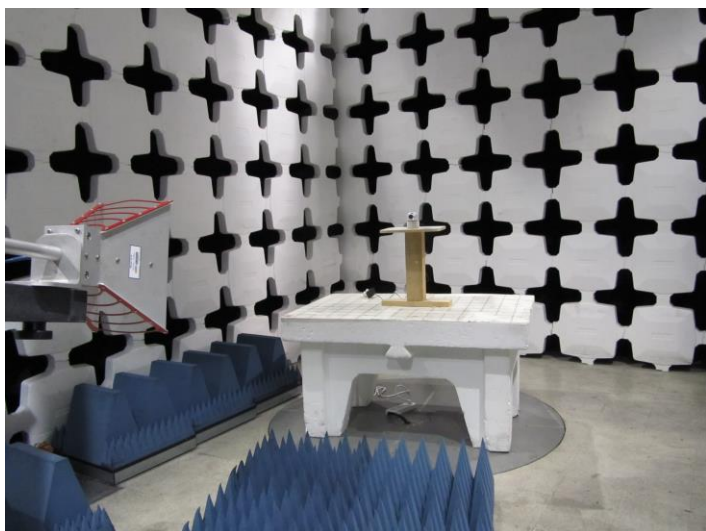
Photo 3. Radiated Emission 1GHz-18GHz