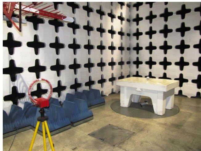
Photo 2. Radiated Emission below 30MHz