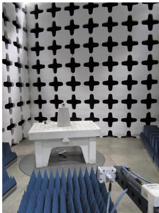
Photo 4. Radiated Emission above 18GHz