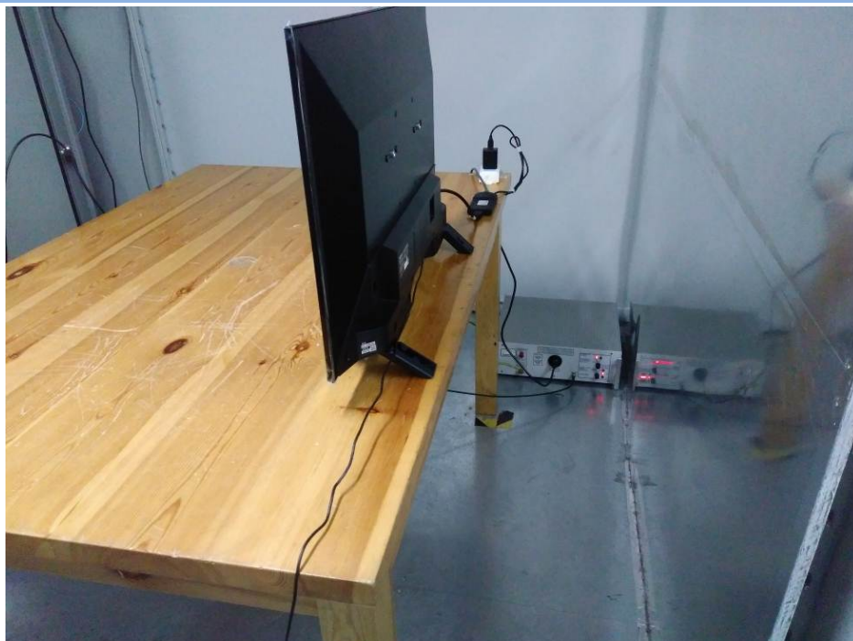
The Working Test Mode (Side)