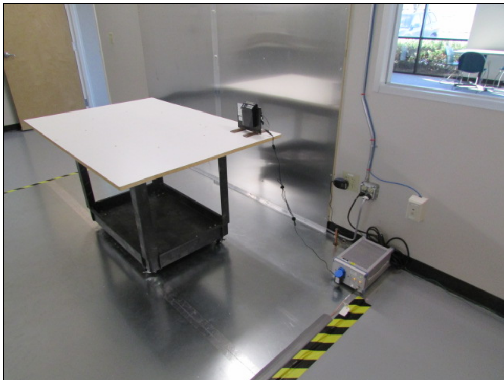
Figure 4: Power Line Conducted Emissions Test Set Up – Side View