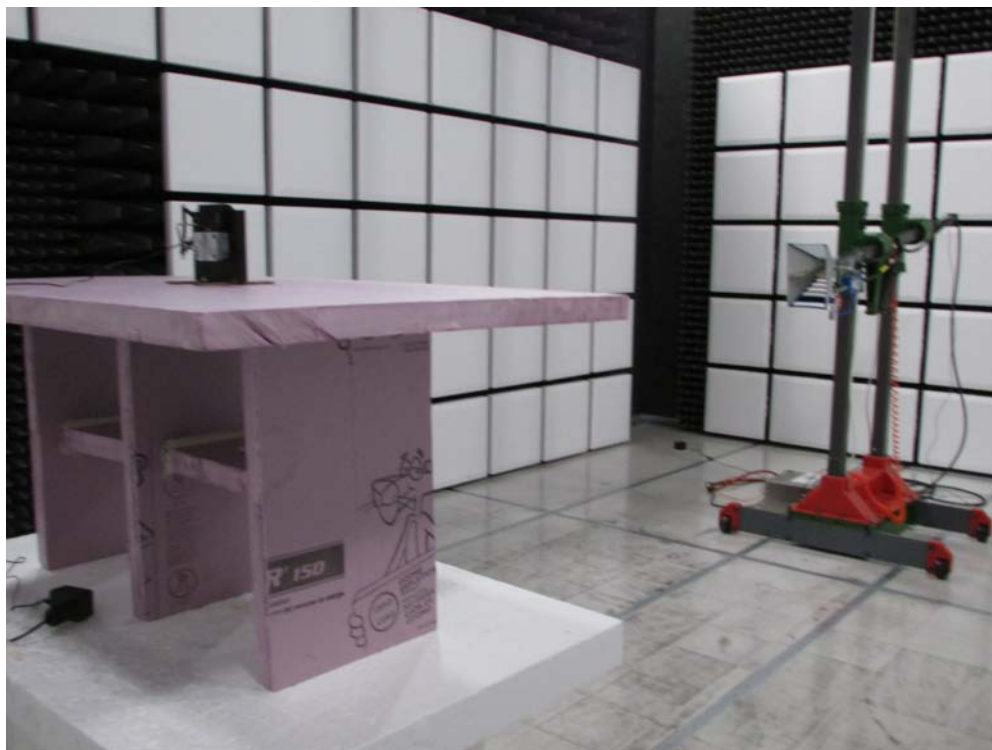
Figure 2: Radiated Emissions Test Set Up – Rear View