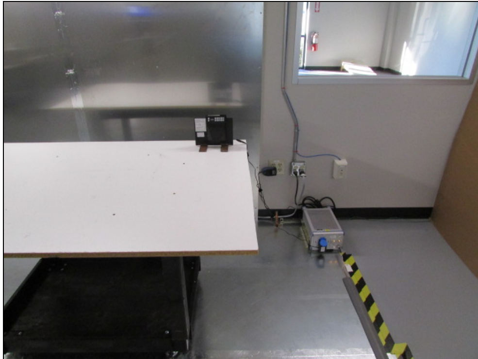
Figure 3: Power Line Conducted Emissions Test Set Up – Front View