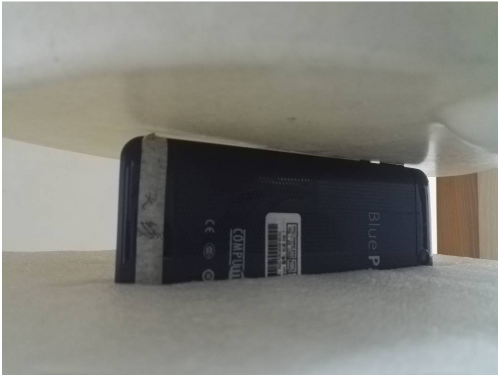
Body-worn Bottom Setup Photo (0mm)