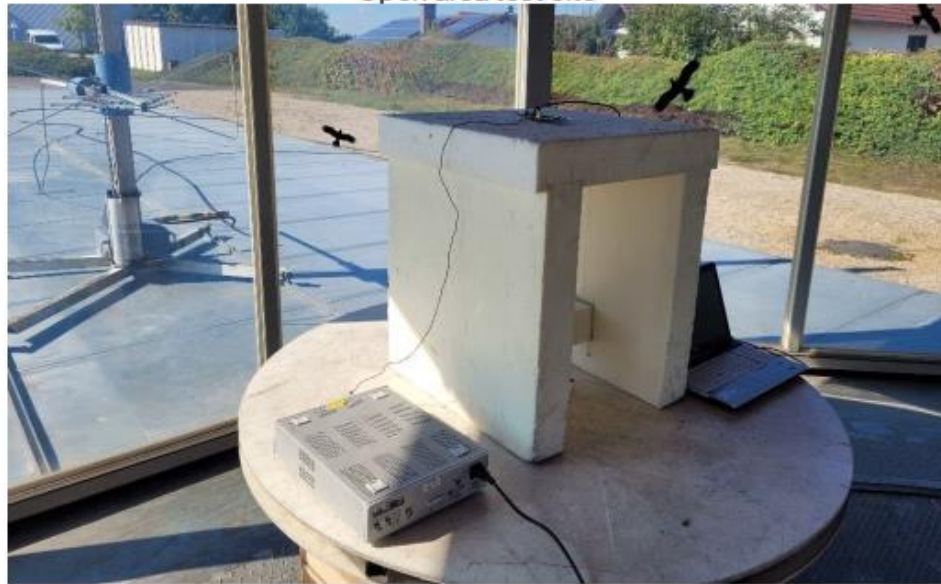
Open area test site