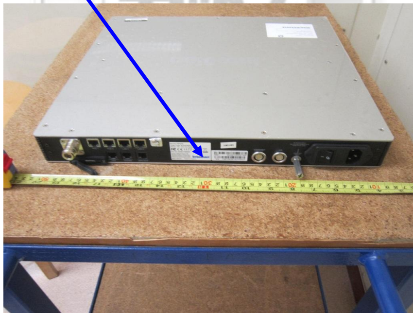
Physical Location of FCC Label on EUT