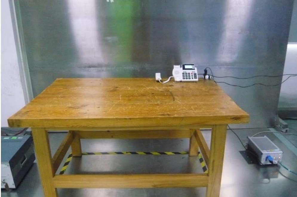
Conducted Emissions - Side View (Adapter)