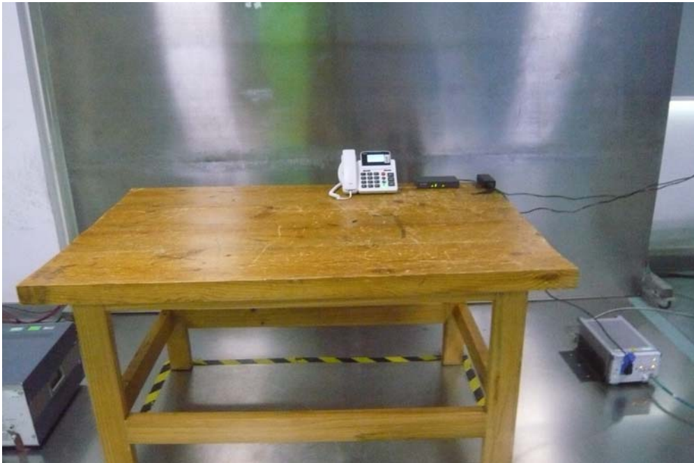
Conducted Emissions - Side View (POE)