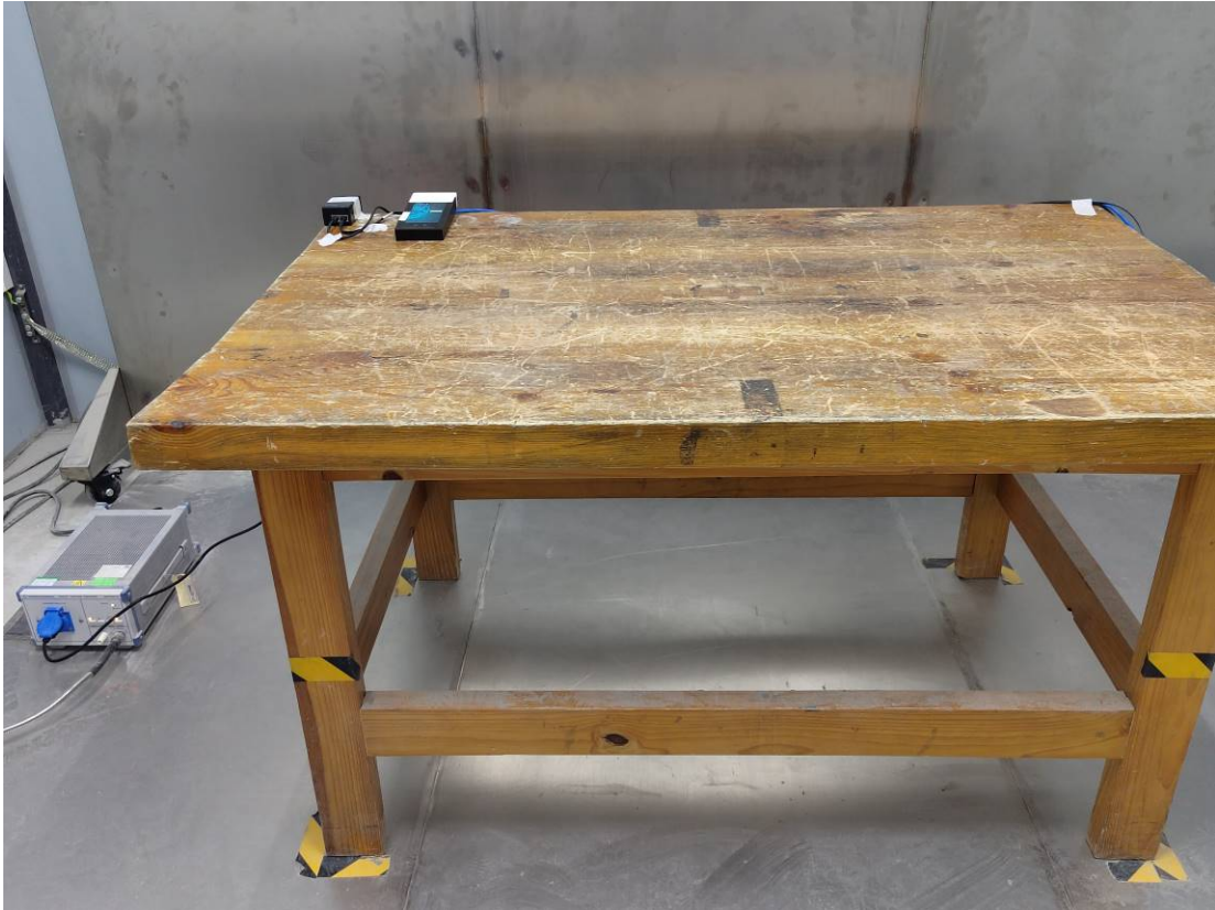
Conducted Emissions Side View-POE- E16C