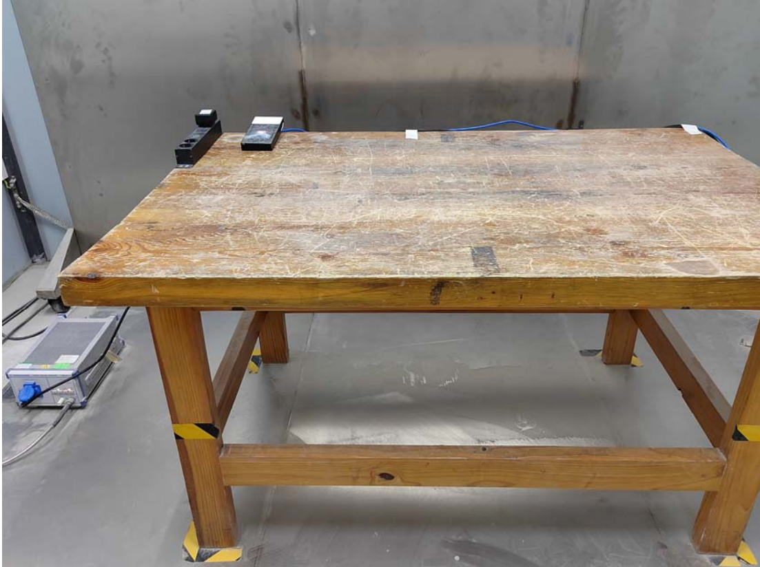
Conducted Emissions Side View Adapter- A05C