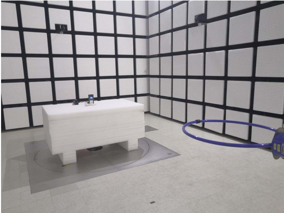
Radiated Emission Below 30MHz- 1GHz View- E16C