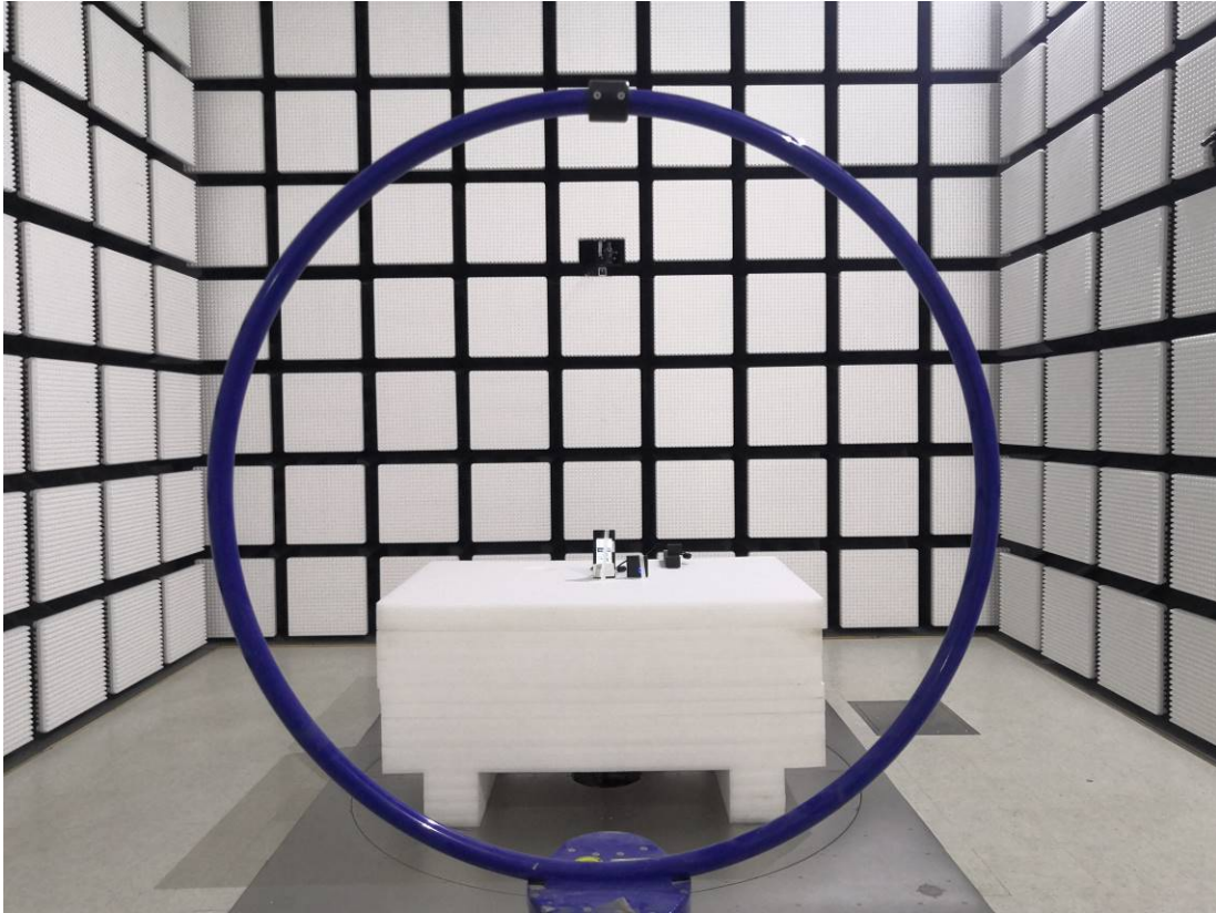
Radiated Emission Below 9kHz- 30MHz View Perpendicular- E16C