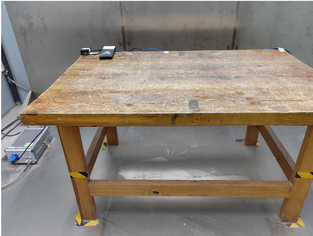
Conducted Emissions Side View-POE- A05C