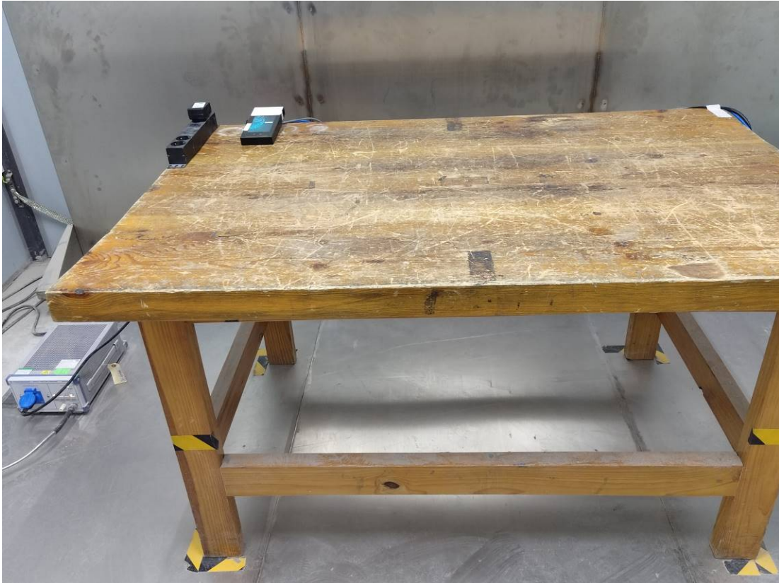
Conducted Emissions Side View Adapter- E16C