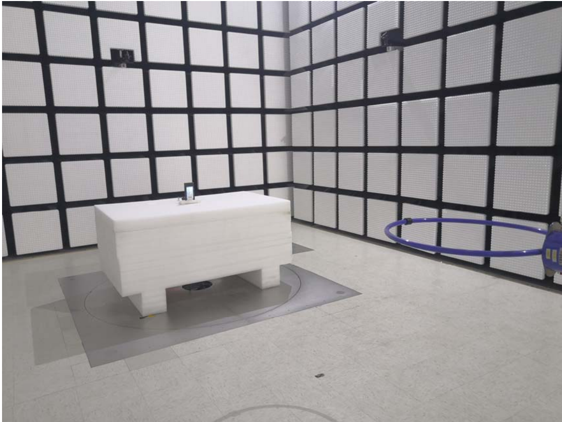
Radiated Emission Below 30MHz- 1GHz View- A05C