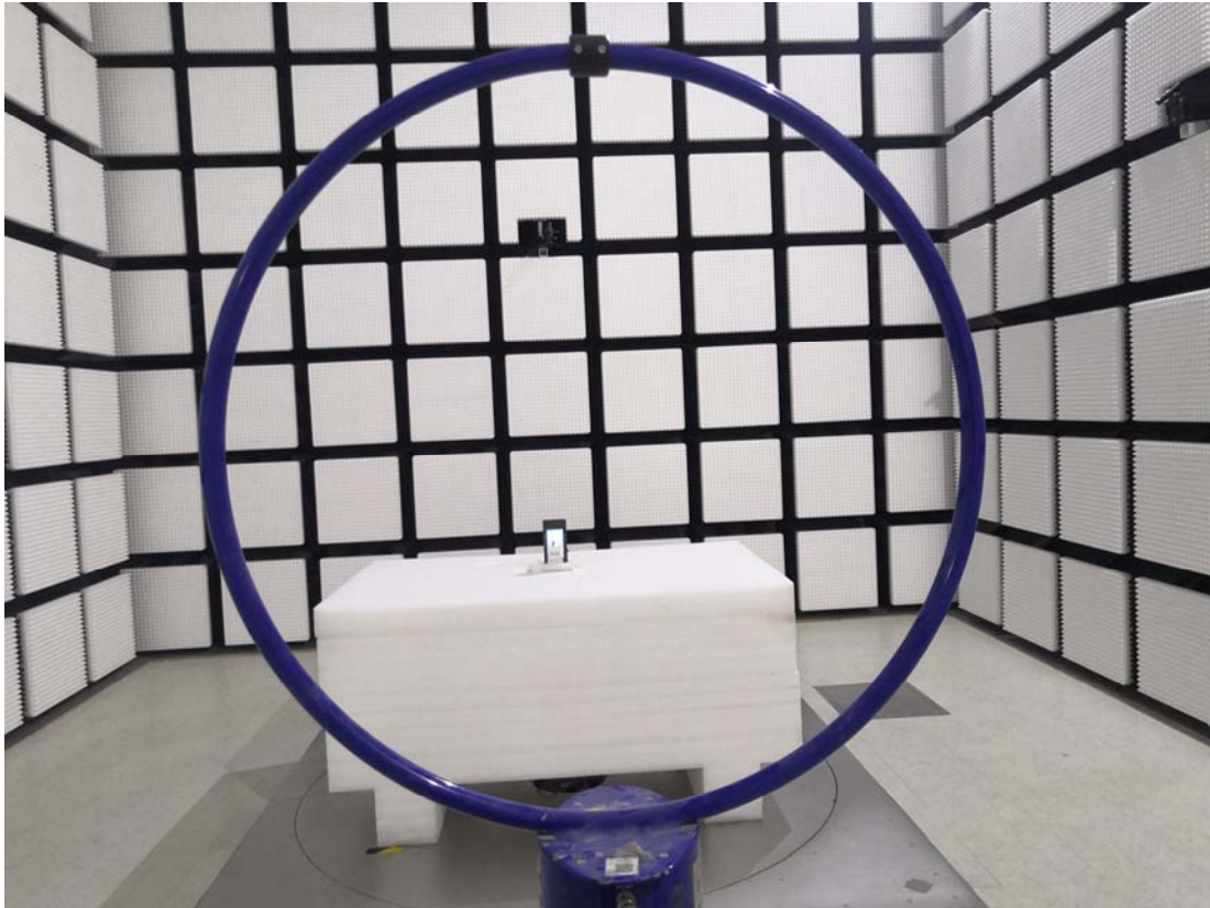
Radiated Emission Below 9kHz- 30MHz View Perpendicular- A05C