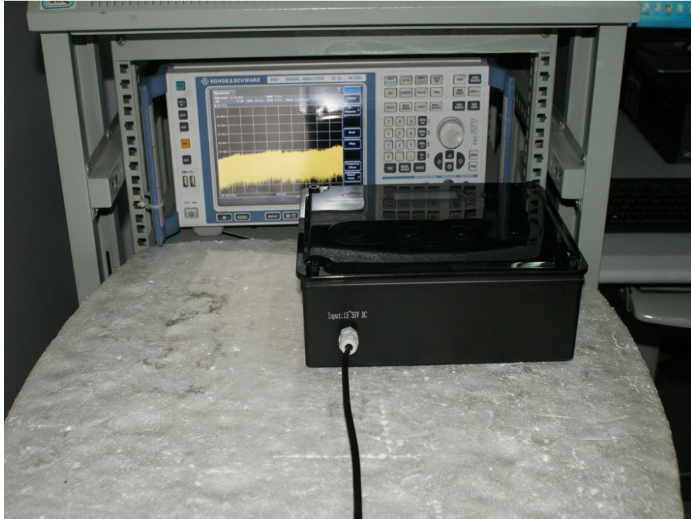
Photograph 6: Set-up for conducted emission test