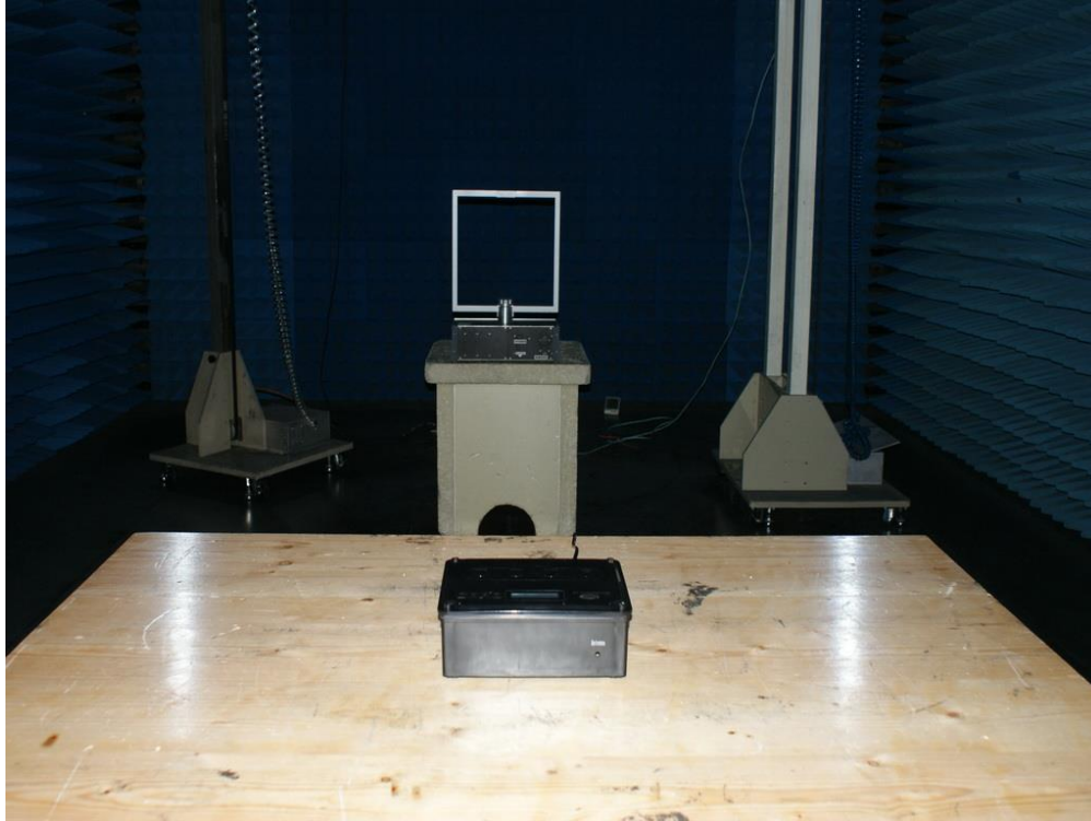
Photograph 2: Set-up for Spurious Emissions (30MHz-1GHz)