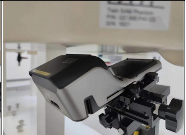
Figure 2 Back Side mode