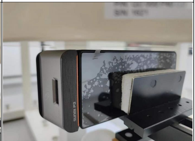
Figure 4 Right Side mode