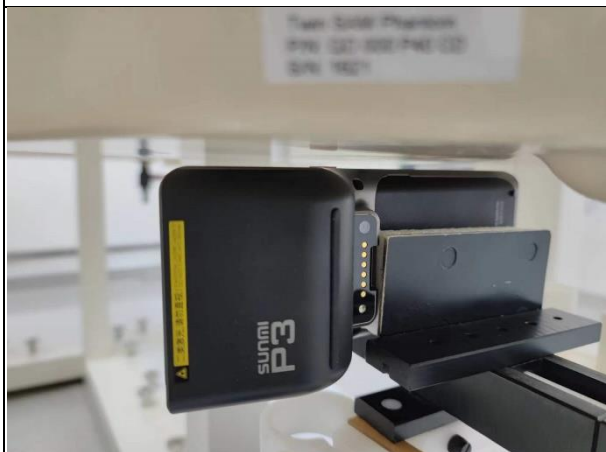
Figure 3 Left Side mode