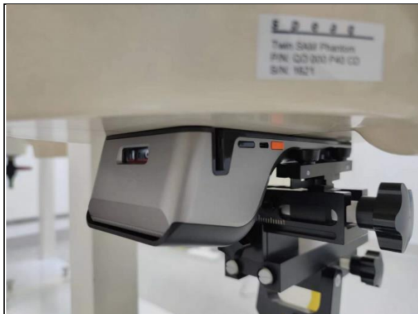
Figure 6 Front Side mode

According to the antenna position, the Limb SAR is tested at the following 5 test positions all with the distance =0mm between the EUT and the phantom bottom: