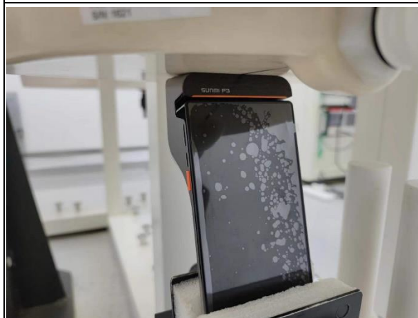
Figure 10 Top Side mode