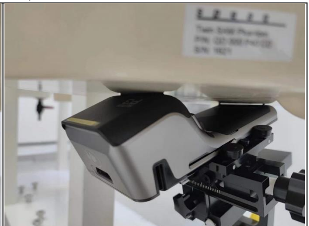
Figure 7 Back Side mode