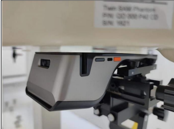
Figure 1 Front Side mode

According to the antenna position, the Body SAR is tested at the following 5 test positions all with the distance =5mm between the EUT and the phantom bottom: