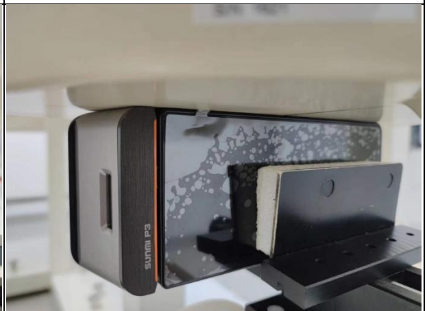
Figure 9 Right Side mode