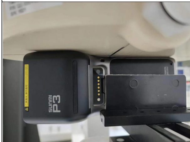
Figure 8 Left Side mode