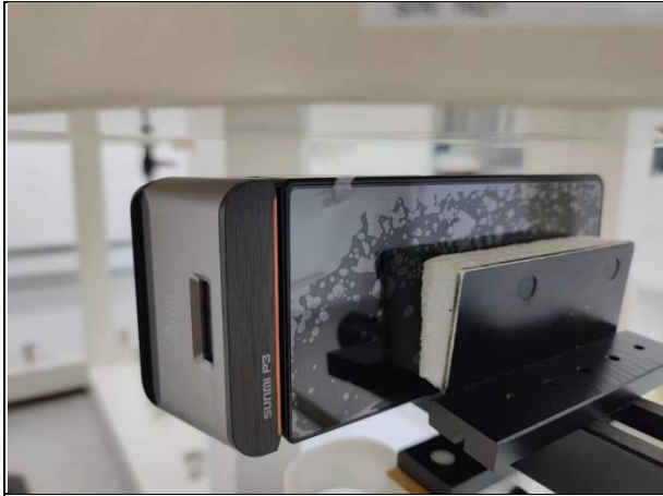
Figure 11 Right Side mode 16mm

The sensor triggering minus 1 mm SAR is tested at the following 1 test positions with the distance =16mm between the EUT and the phantom bottom: