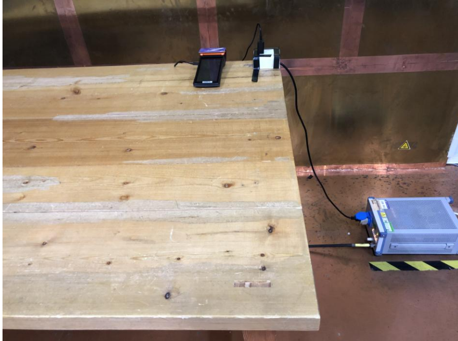
Picture3: Conducted Emissions