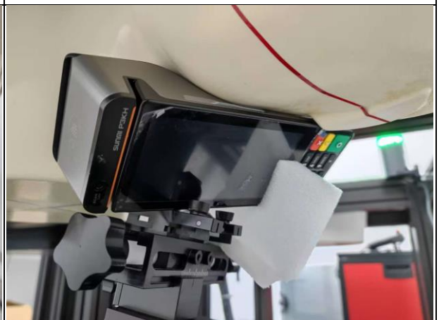
Figure 9 Back Side-3 mode