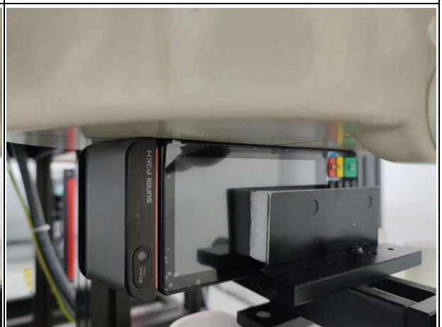
Figure 11 Right Side mode