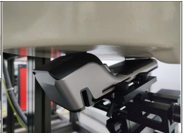
Figure 7 Back Side-1 mode