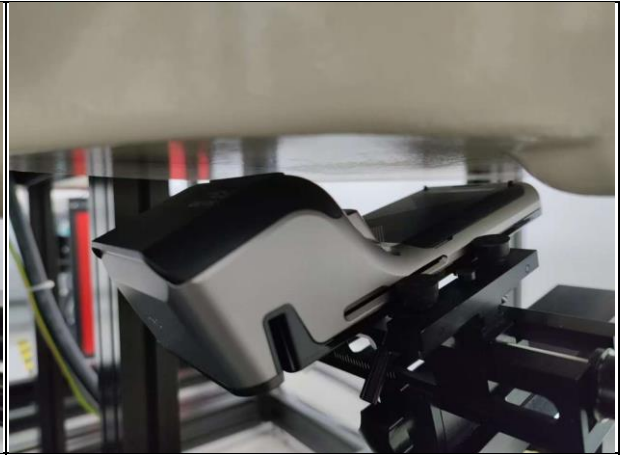
Figure 2 Back Side mode