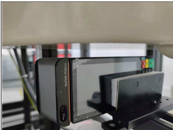
Figure 13 Right Side mode 16mm

The sensor triggering minus 1 mm SAR is tested at the following 1 test positions with the distance =16mm between the EUT and the phantom bottom: