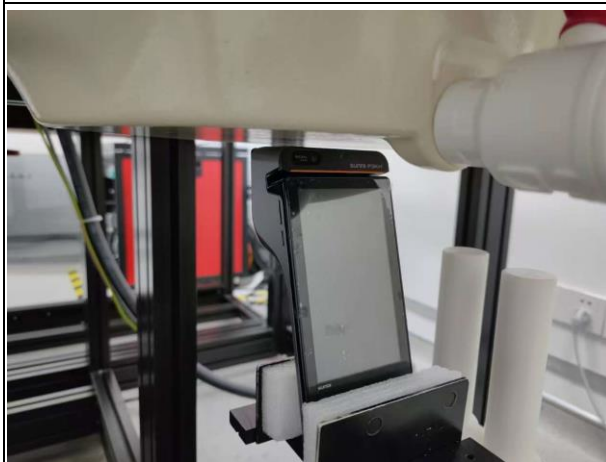
Figure 5 Top Side mode