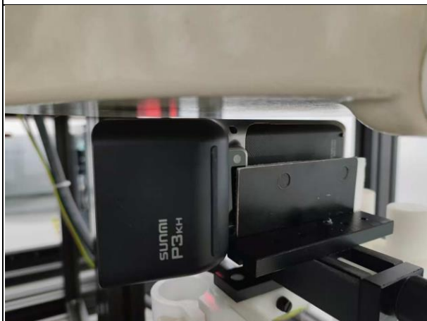
Figure 3 Left Side mode