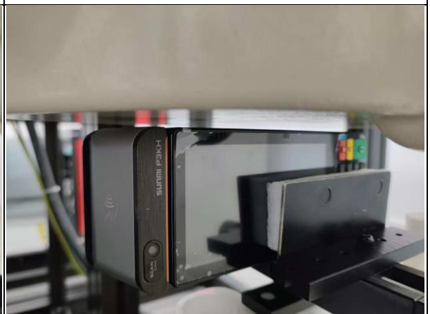
Figure 4 Right Side mode