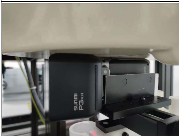
Figure 10 Left Side mode