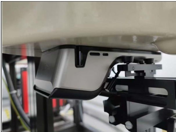
Figure 6 Front Side mode

According to the antenna position, the Limb SAR is tested at the following 7 test positions all with the distance =0mm between the EUT and the phantom bottom: