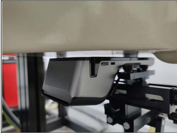
Figure 1 Front Side mode

According to the antenna position, the Body SAR is tested at the following 5 test positions all with the distance =5mm between the EUT and the phantom bottom: