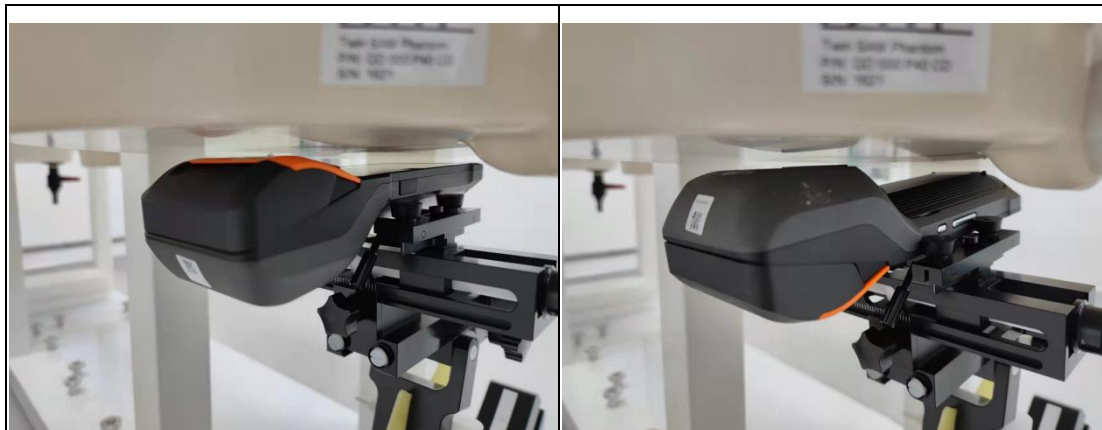
Figure 1-1 Front Side mode

According to the antenna position, the Body-worn/hotspot SAR is tested at the following 5 test positions all with the distance =5mm between the EUT and the phantom bottom: