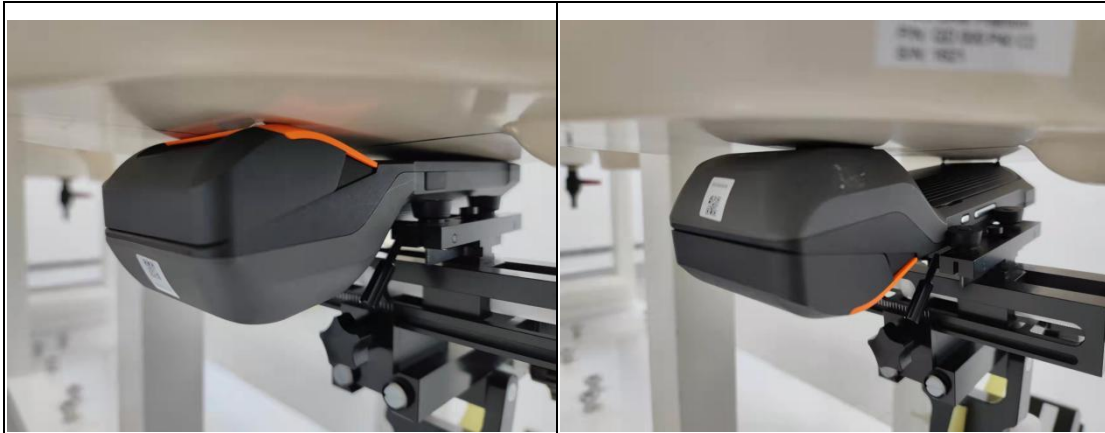
Figure 1-6 Front Side mode

According to the antenna position, the limb SAR is tested at the following 5 test positions all with the distance =0mm between the EUT and the phantom bottom: