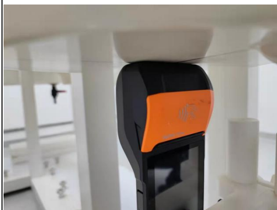
Figure 1-10 Top Side mode