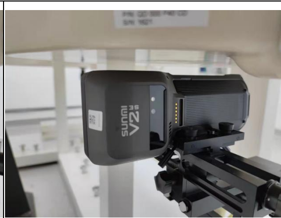
Figure 1-12 Left Side mode 9mm