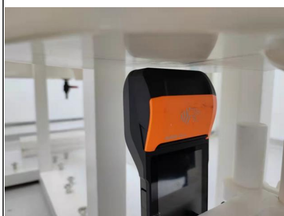
Figure 1-5 Top Side mode