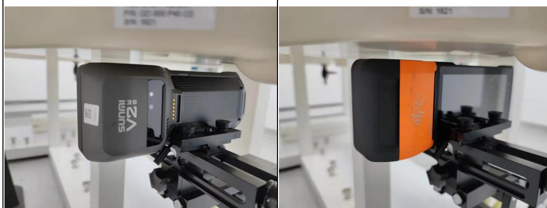
Figure 1-3 Left Side mode