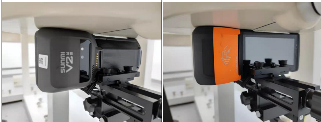
Figure 1-8 Left Side mode