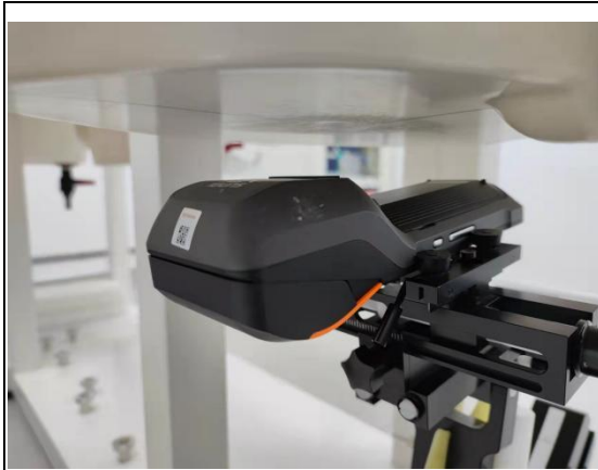
Figure 1-11 Back Side mode 24mm

The sensor triggering minus 1 mm SAR is tested at the following 3 test positions with the distance =24&9&14mm between the EUT and the phantom bottom: