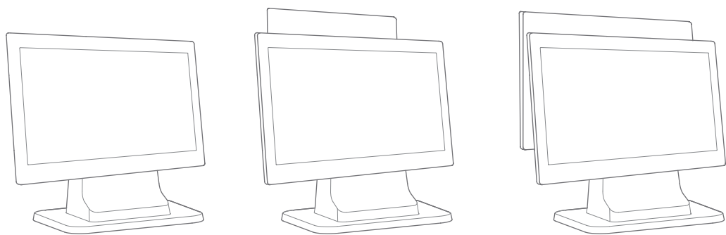
15.6" Touch Screen