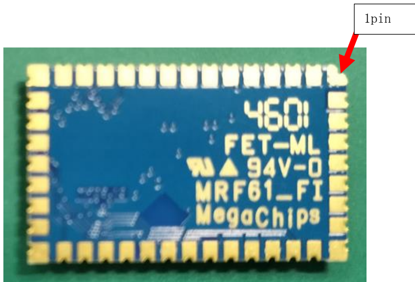
Picture 3-3 MRF61_FI_F1/TH Bottom view