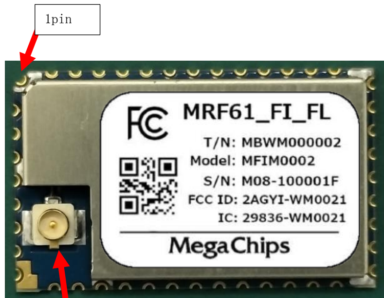
Picture 3-1 MRF61_FI_FL Top view