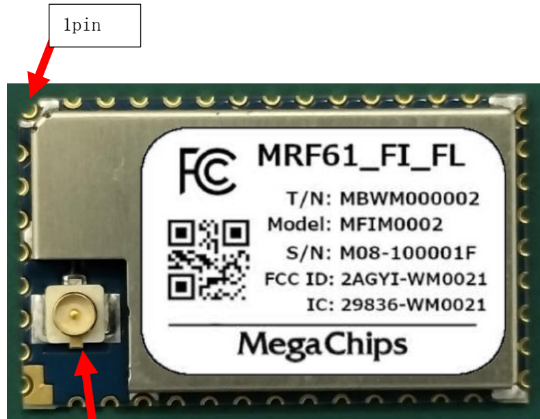
Picture 3-1 MRF61_FI_FL Top view