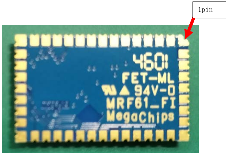
Picture 3-3 MRF61_FI_F1/TH Bottom view