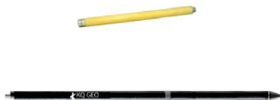
Extension pole (up) and centering pole (down)