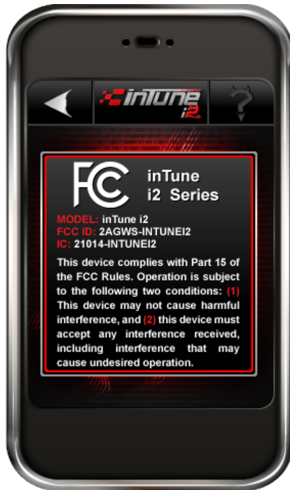
Figure 2: Sample Label Location