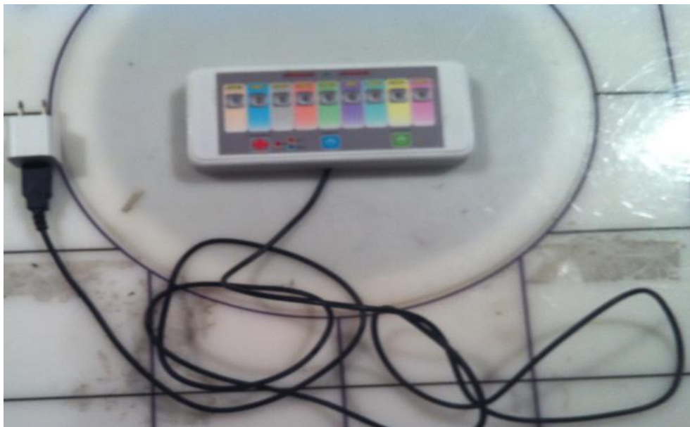
Rose1 with AC to DC adapter