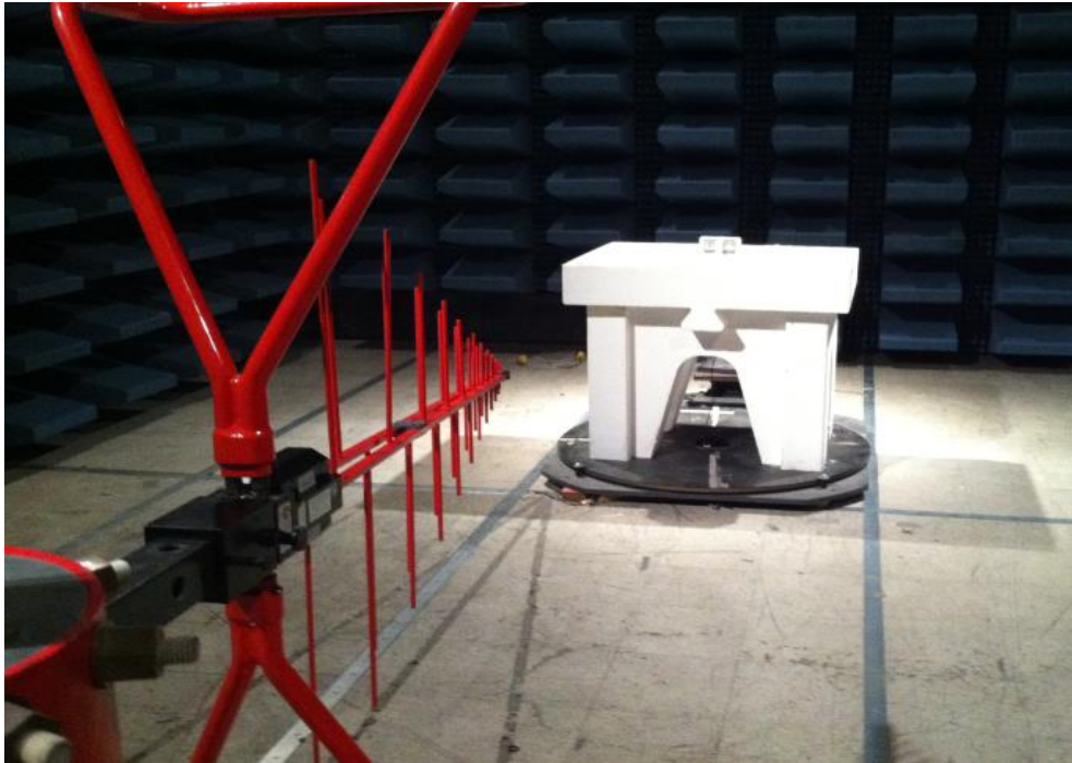
Radiated Emission test setup in Semi Anechoic Chamber – 30MHz - 1GHz