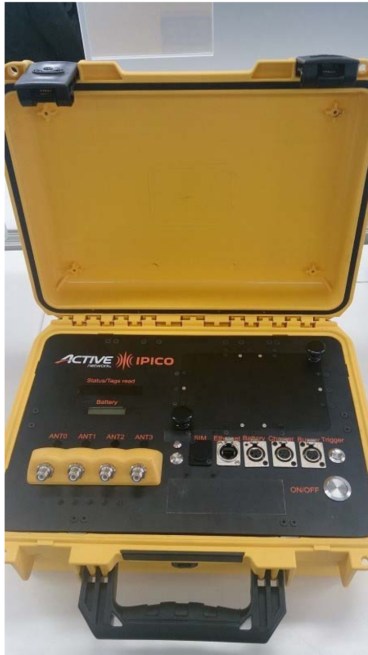
Photo of TUHF-READER-3920

This User Manual provides instructions for installing and operating the TUHF-READER-3920