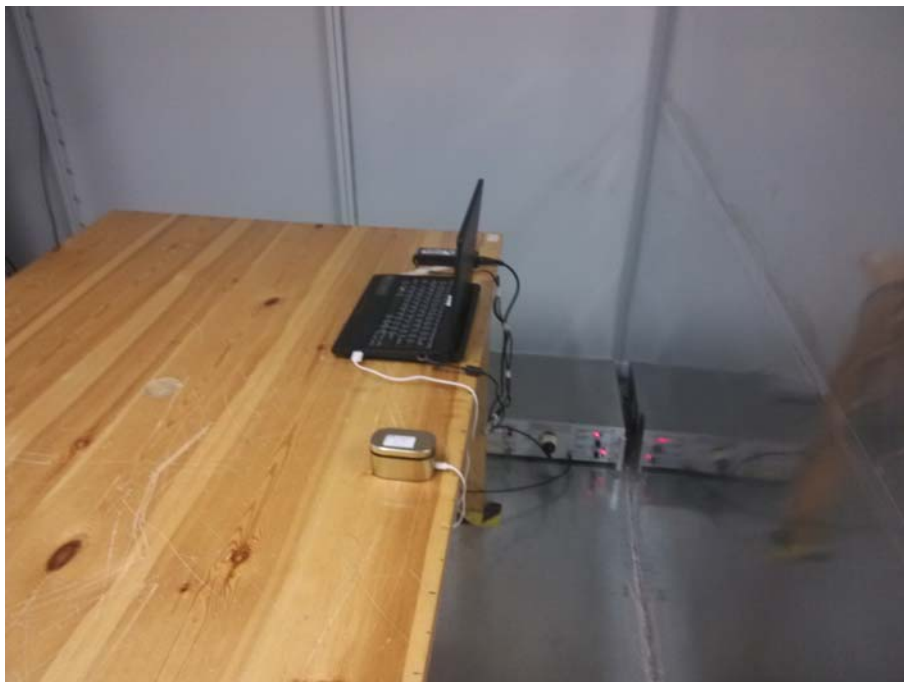
Conducted Emission Test