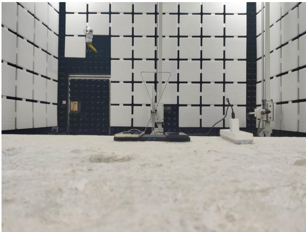
Radiated Emission below 1GHz