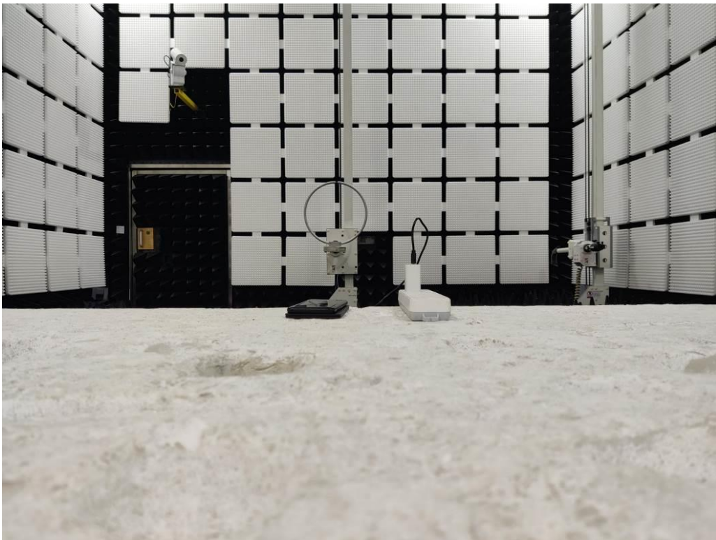
Radiated Emission below 30MHz