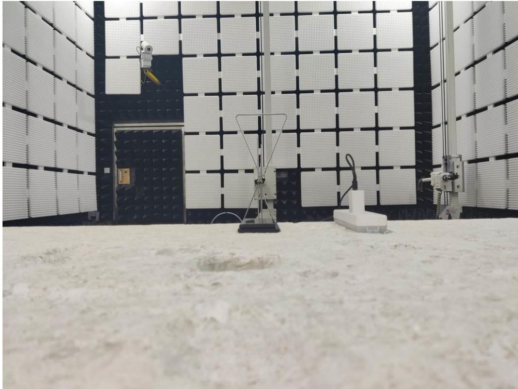
Radiated Emission below 1GHz