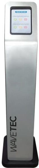
M-13 Feedback Lite (No Printer)

Above differnces is with 2 type of printer and in M-13 Feedback Lite is with out printer