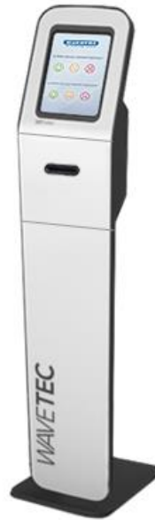
M-13 TDU with Custom Printer

■ Please provide at least 1 sample with difference except specified as above for further evaluation. 如有以下所述差异，需提供1个样板做进一步评估。