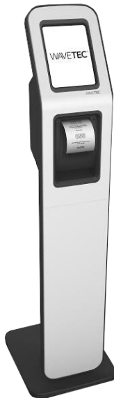
M-13 TDU with Bixelon printer