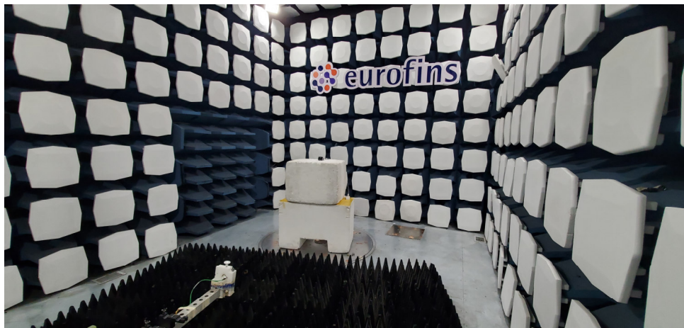
18GHz - 26.5GHz