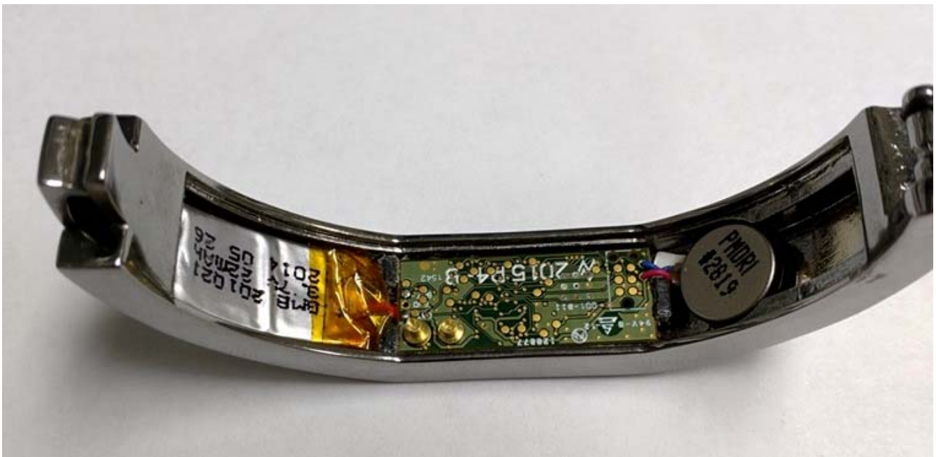
Circuit Board as Installed, Back Cover Removed