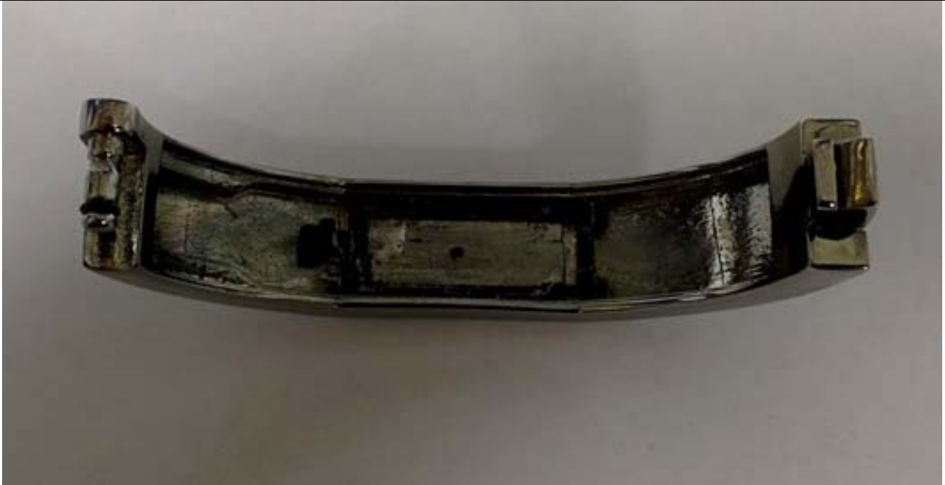
Frame Inside (Back Side of Antenna) Before Installing Circuit Board